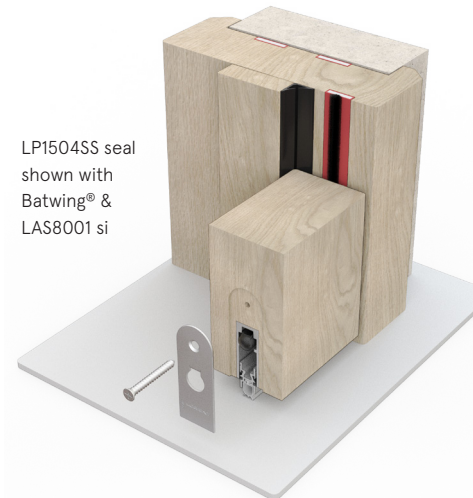
LP1504SS seal shown with Batwing® & LAS8001 si

The products do not fall within the scope of COSHH regulations. Lorient intumescent seals should be stored flat in a clean, dry, dust-free area away from heat and at a storage temperature of between 5°C and 40°C.