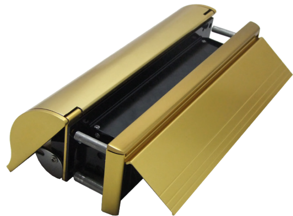
▶ RJ008 Letterplate