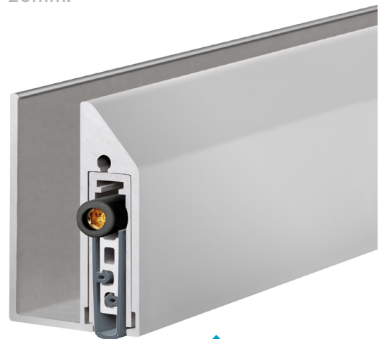
Planet KG-A12 Narrow