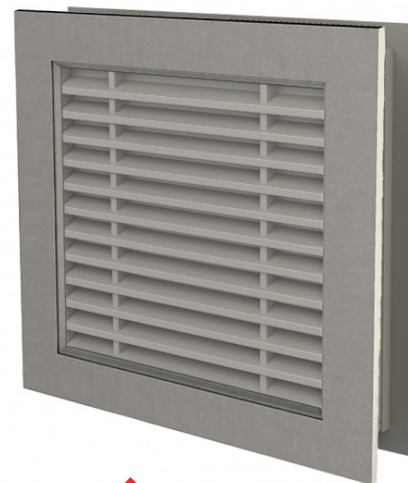
LVN20 shown with aluminium flange