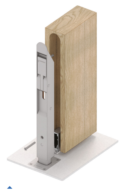
Patent No. 1718821