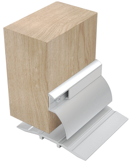
▲ LAS9005 (shown with LAS4010)