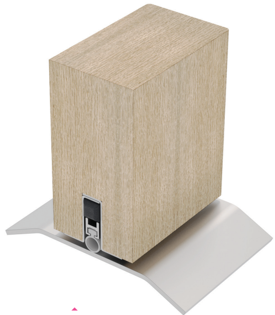
▲ LAS8060 (shown with LAS4050)