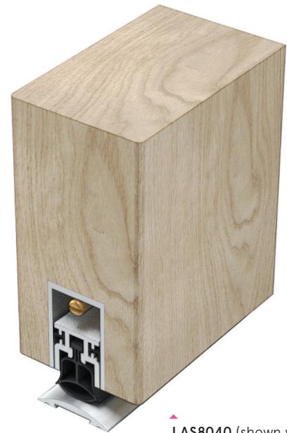
LAS8040 (shown with LAS4001)