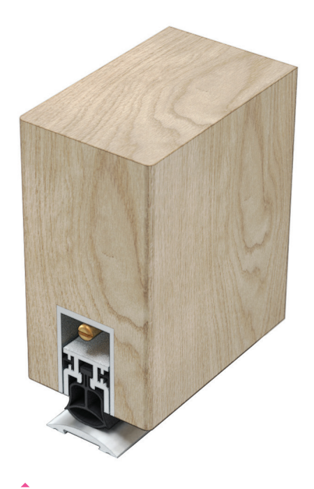
LAS8040 (shown with LAS4001)