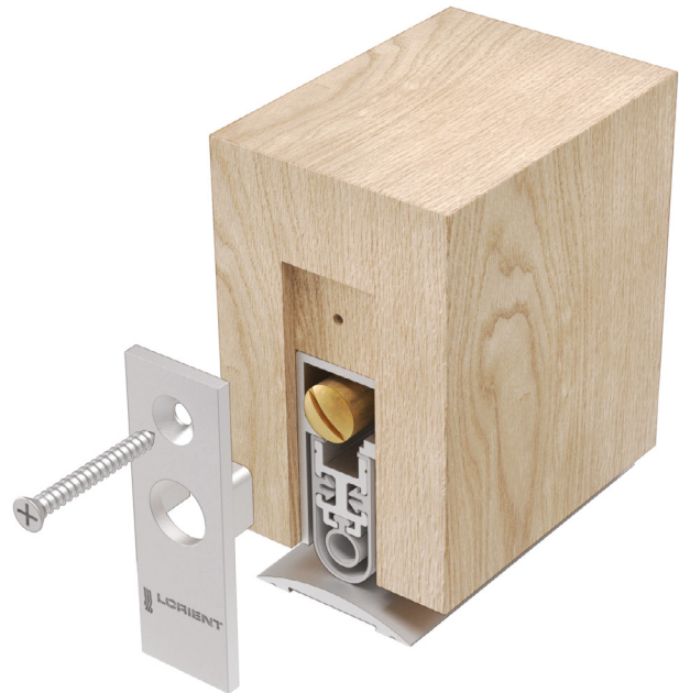
▲ LAS8014 si (shown with LAS4002)