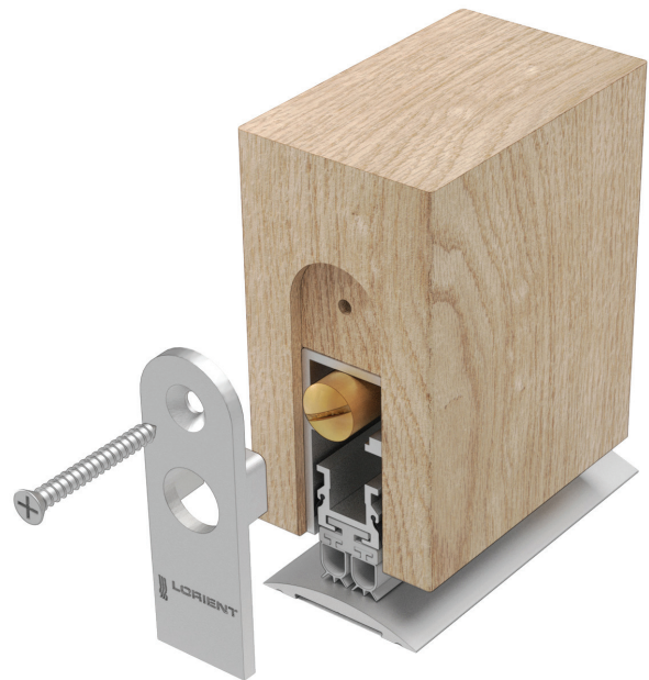
LAS8013 si (shown with LAS4002)