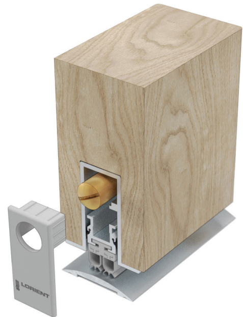
LAS8012 si (shown with LAS4002)