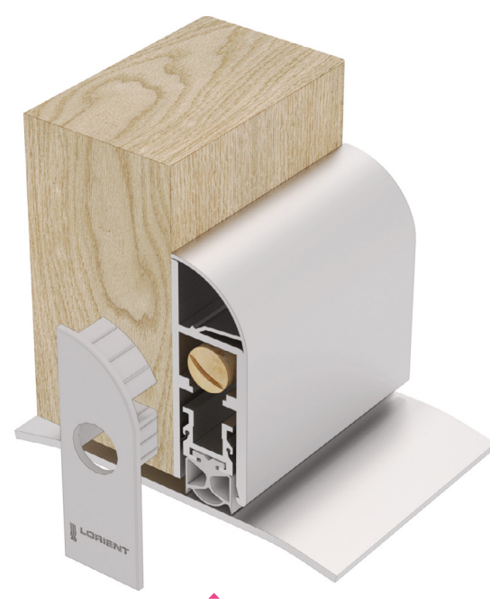
LAS8009 si (shown with LAS4055)