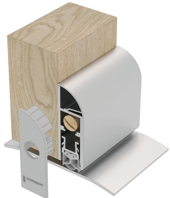
LAS8009 si (shown with LAS4055)