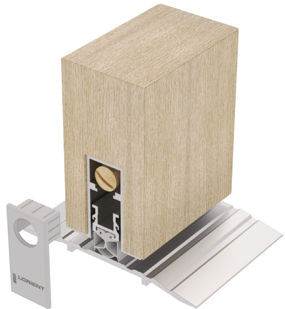
LAS8007 si (shown with LAS4011)