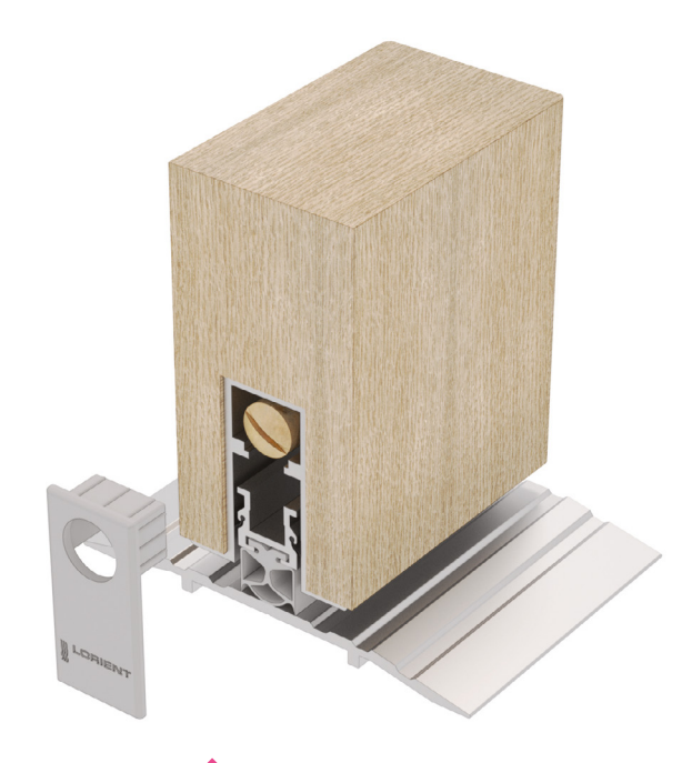
LAS8007 si (shown with LAS4011)