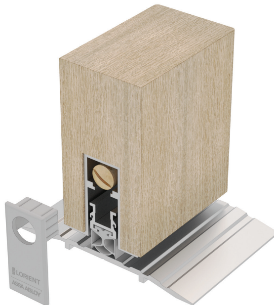
LAS8007 si (shown with LAS4011)