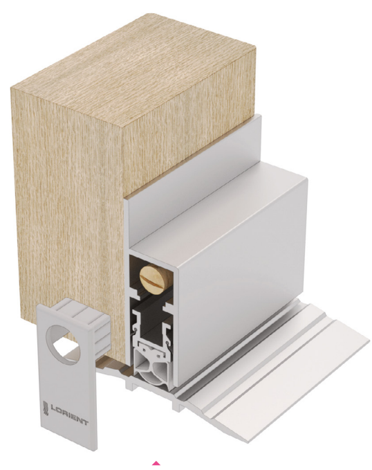
LAS8006 si (shown with LAS4010)