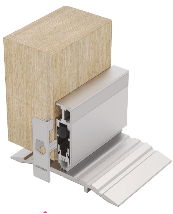
LAS8003 si (shown with LAS4100)