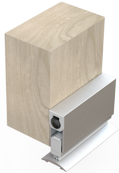
▲ LAS8002 si (shown with LAS4001)