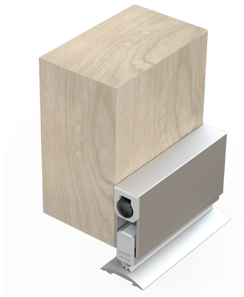
LAS8002 si (shown with LAS4001)