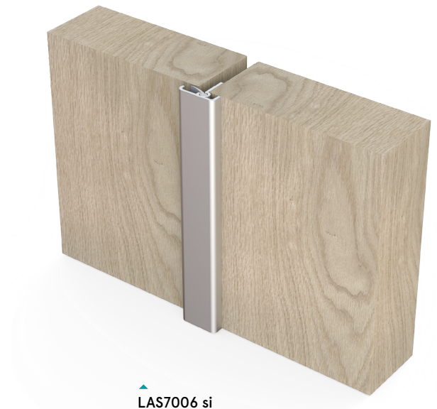
▲ LAS7006 si