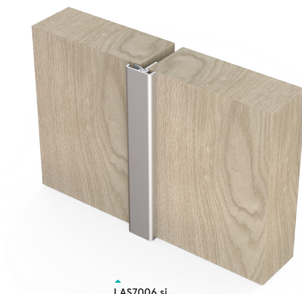
▲ LAS7006 si