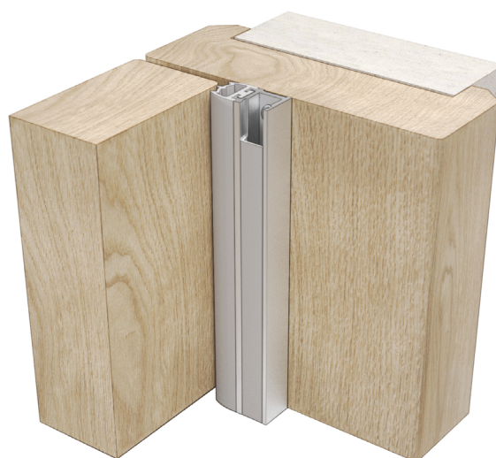
▲ LAS7005 si