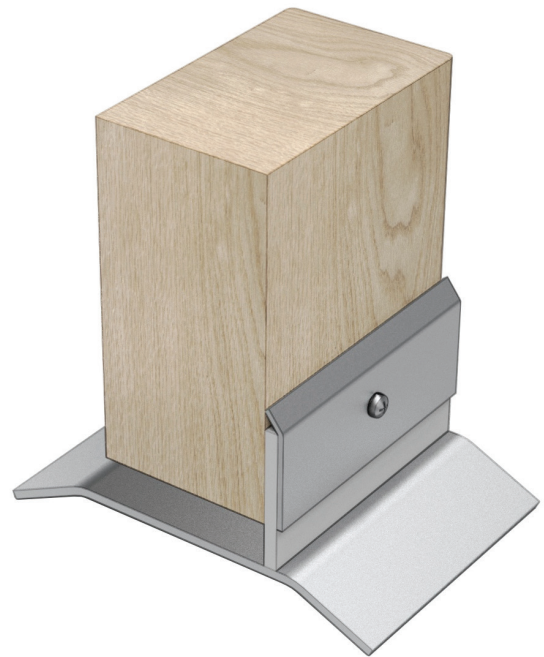
▲ LAS3050 (shown with LAS4050)