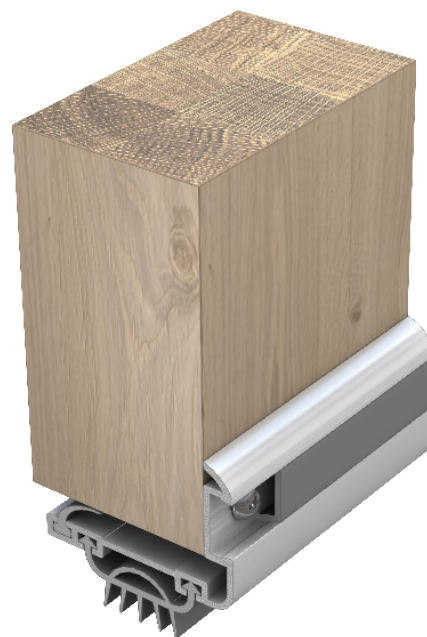
▲ LAS3010 si