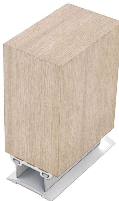
LAS3009 si (shown with LAS4002)