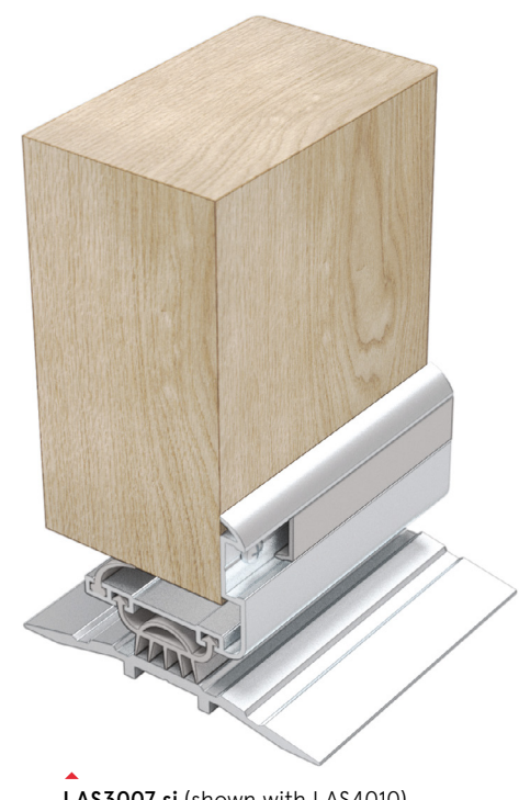
LAS3007 si (shown with LAS4010)