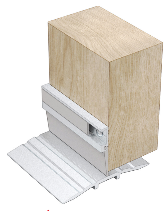
LAS3004 si (shown with LAS4010)