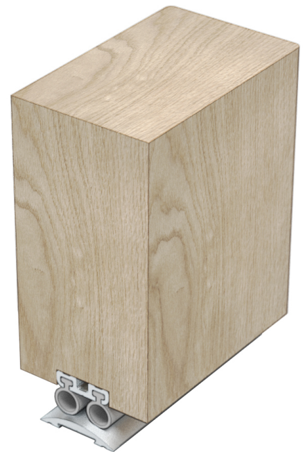
▲ LAS3003 si (shown with LAS4001)