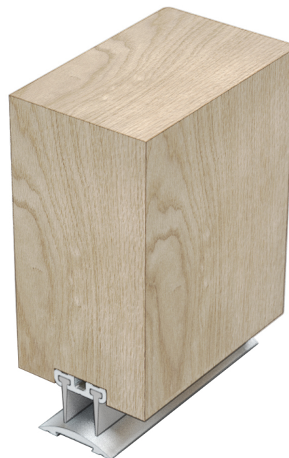
LAS3002 si (shown with LAS4001)