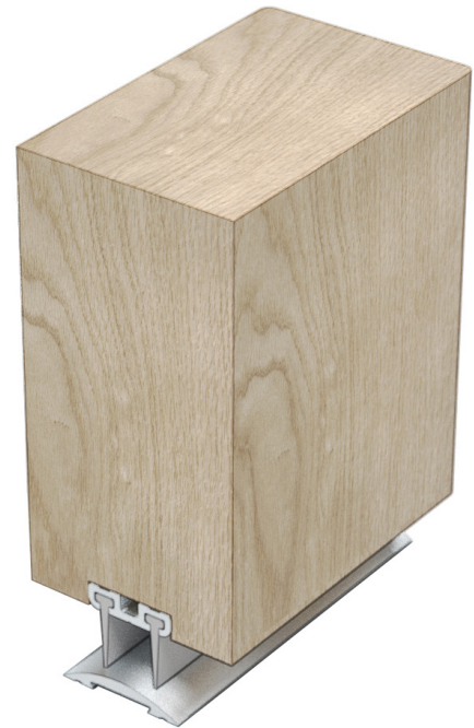
▲ LAS3002 si (shown with LAS4001)