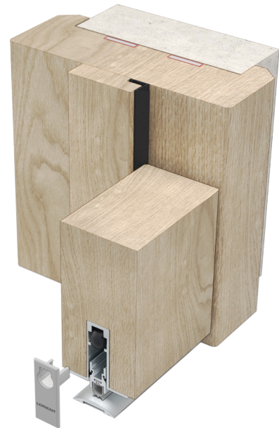
▲ LAS1206K Batwing®