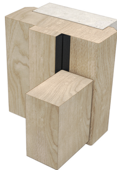
▲ LAS1212 Batwing®