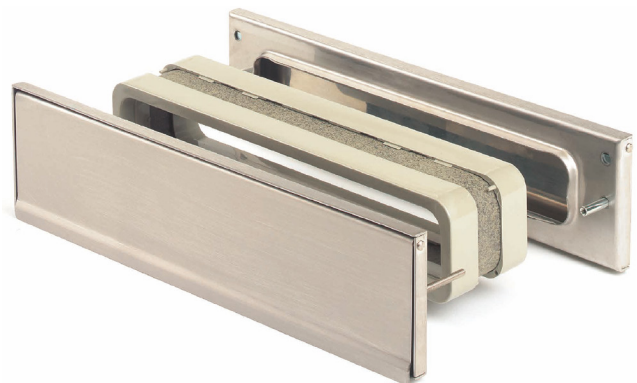
▲ High performance fire, smoke + security letterplate