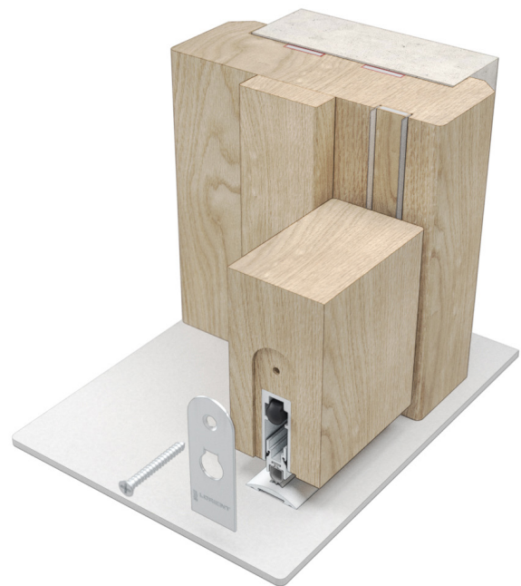
Finesse™ (Shown with LAS8001 si + LAS4001)