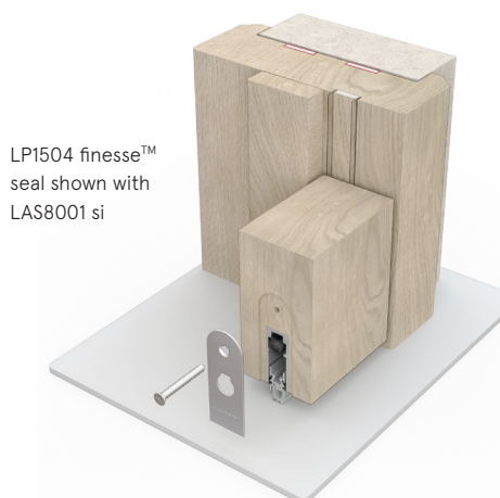
LP1504 finesse™ seal shown with LAS8001 si

All rights reserved. No part of this fitting guide may be reproduced, stored in a retrieval system, or transmitted in any means, electronic, mechanical, photocopying, recording or otherwise without the written permission of Lorient. © Lorient 2022