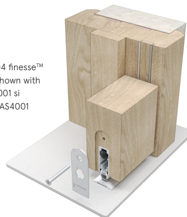
LP1504 finesse™ seal shown with LAS8001 si and LAS4001

The products do not fall within the scope of COSHH regulations. Lorient intumescent seals should be stored flat in a clean, dry, dust-free area away from heat and at a storage temperature of between 5°C and 40°C.