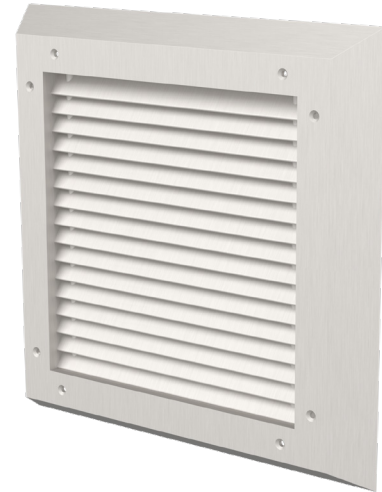
Aluminium cover grille