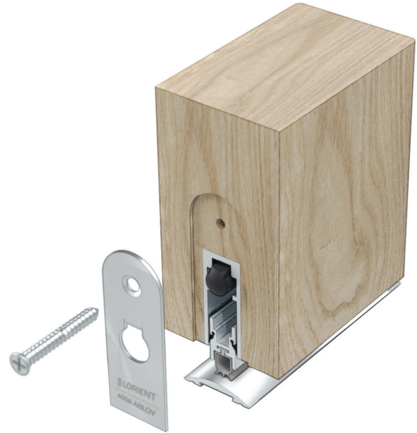
LAS8001 si (shown with LAS4001)